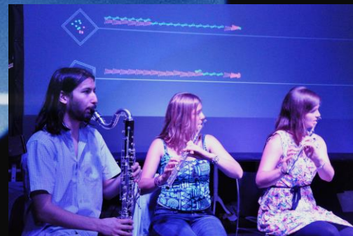
Performers interpreting generated symbolic score

“Gave me options to create in a different way to how I normally do.”